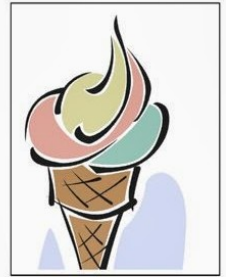
Ice cream cone £1.05

You have £5 to spend what will you buy and how much change will you have? How many different answers can you make?