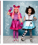
Alice in Wonderland